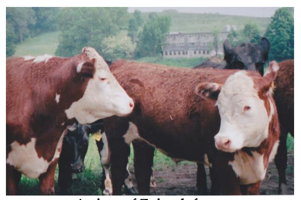
A view of Zaiceck farm

All About Ashford is a service provided by the Babcock Library, 25 Pompey Hollow Road, Ashford, CT 06278