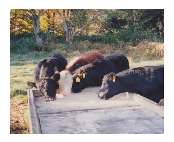
More views of Zaiceck Farm