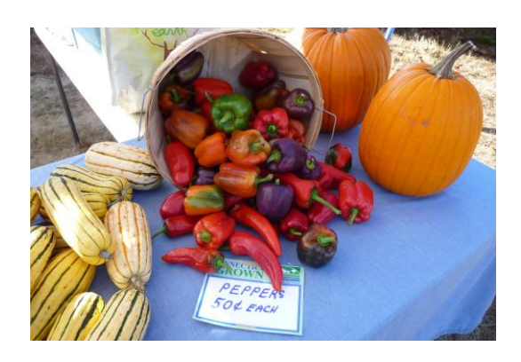
Ashford-grown produce is proudly displayed at the Ashford Farmers Market

The Commission is interested in continuing to promote, support, assist and encourage agriculture now and in the future. To this end we are proud to have a member of National FFA as a member.